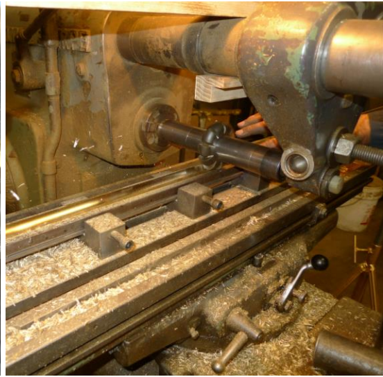
New Door astragal to left, brass "skyscraper" trim to right/ Machining trim moldings