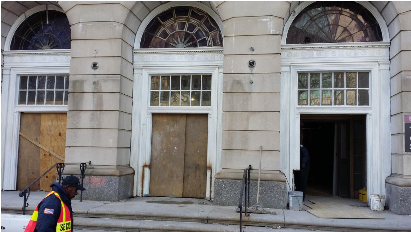
Jambs all cut away over 2' high, repaired in shop, and welded back in place. Frames and lead fanlights stripped and frames repainted.